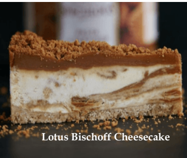
Lotus Bischoff Cheesecake