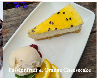
Passionfruit & Orange Cheesecake