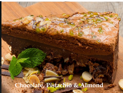
Chocolate, Pistachio & Almond