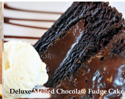
Deluxe Melted Chocolate Fudge Cake