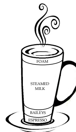
BAILEYS LATTE £5.50