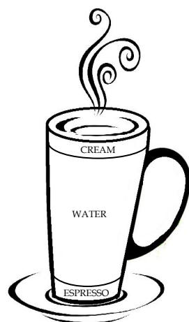
FLOATER COFFEE £3.60