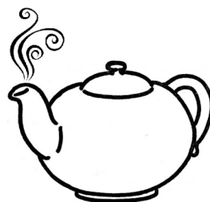
POT OF TEA £2.50