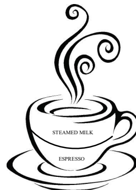
FLAT WHITE £2.95